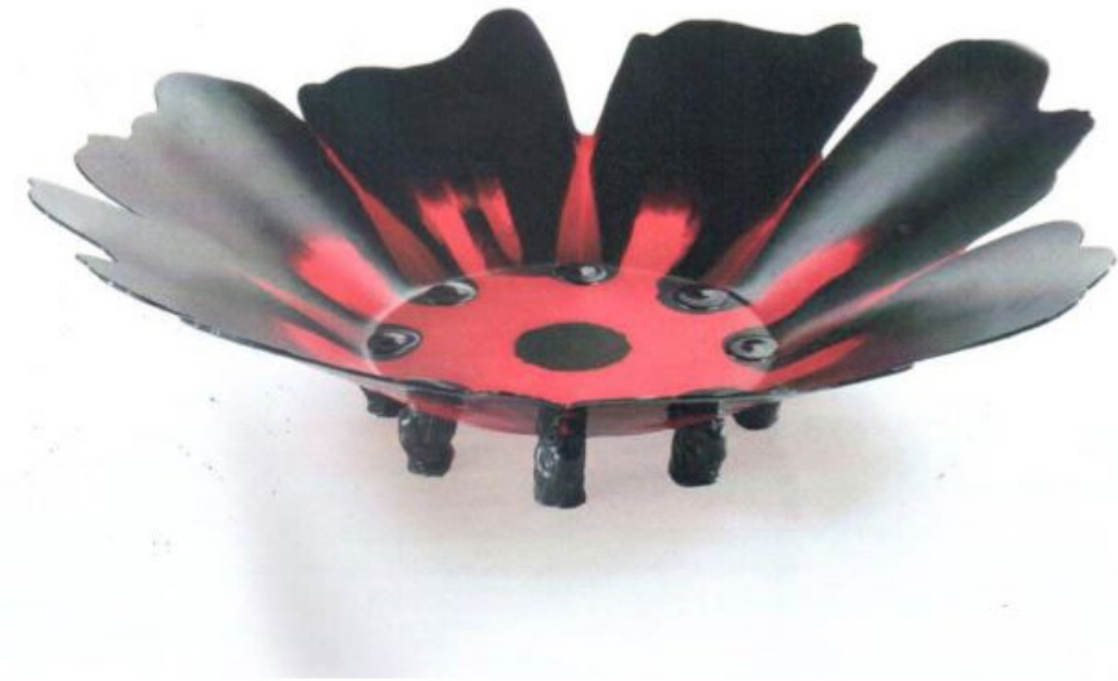
Designer: Gaetano Pesce Title: PAPAVERO VASE Color: Red & Black Dimensions: 71 x 27 cm (LxH) Size: Large $1500 SPECIAL OFFER: $1200