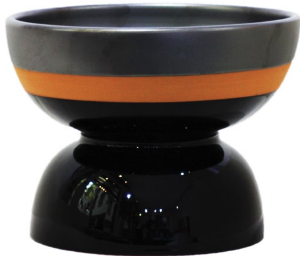
Designer: Ettore Sottsass Title: CENTROTAVOLA PICCOLO Color: Ossidante Size: 20x25 cm (HxL) Edition: 170 $490 SPECIAL OFFER: $400