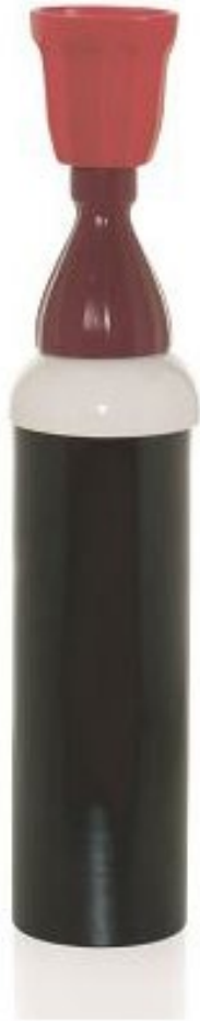
Designer: Nathalie du Pasquier Title: VASE Color: Size: 57 cm (H) Edition: 174 $655 SPECIAL OFFER: $530