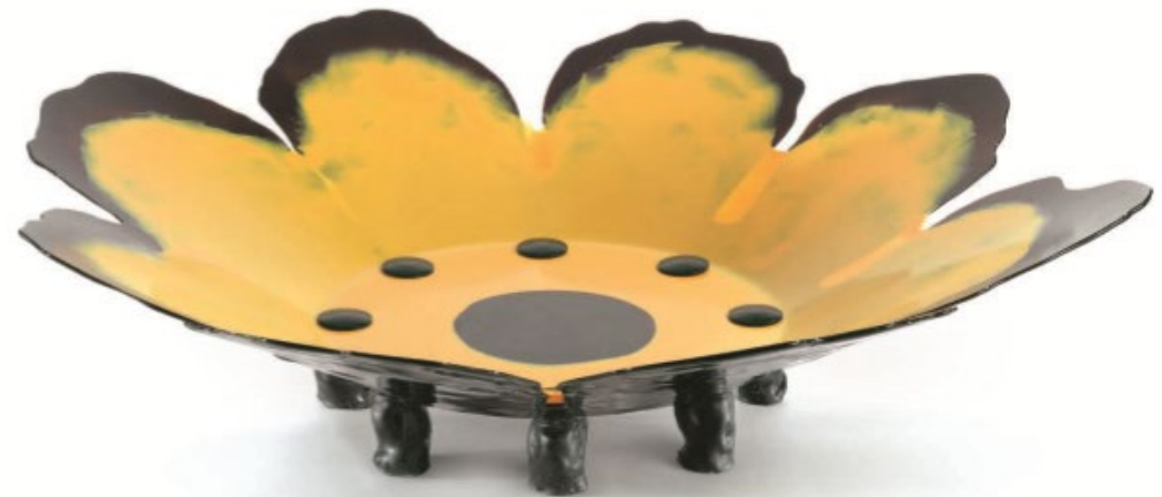
Designer: Gaetano Pesce Title: PAPAVERO VASE Color: Yellow Dimensions: 71 x 27 cm (LxH) Size: Large $1500 SPECIAL OFFER: $1200