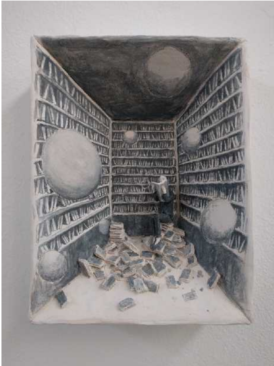
Artist: Pino Deodato Title: Little thoughts Medium: Ingobbio Terracotta Dimensions: 24 x 29 x 08 cm Year: 2017 $7,000 SPECIAL OFFER: $5,600