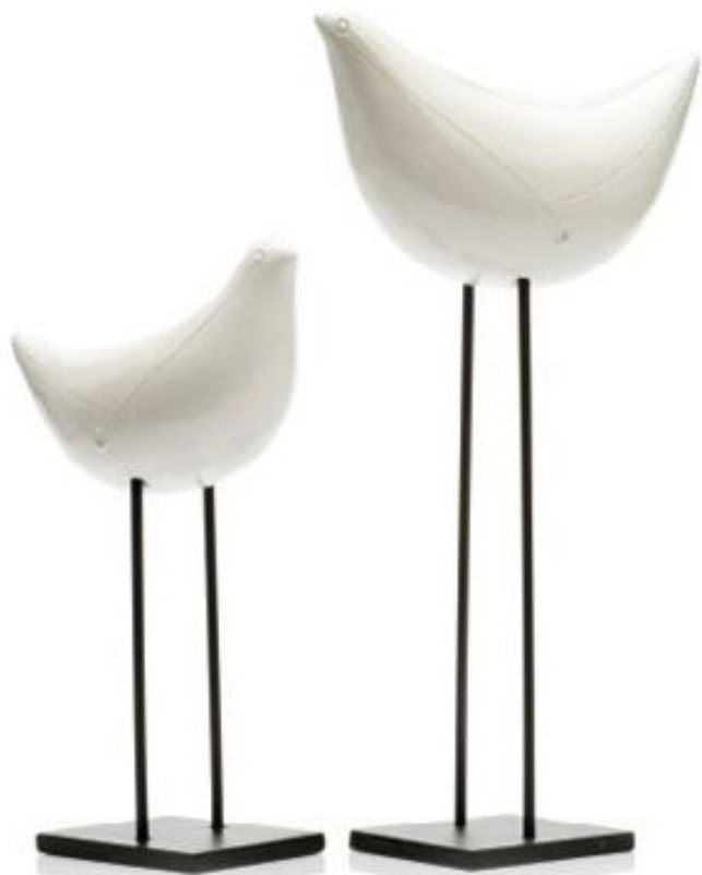
Category: Arkitectura Title: COPPIA UCCELLI Color: Bianchi Size: 21 | 18 cm (H) Edition: 130 $435 SPECIAL OFFER: $350