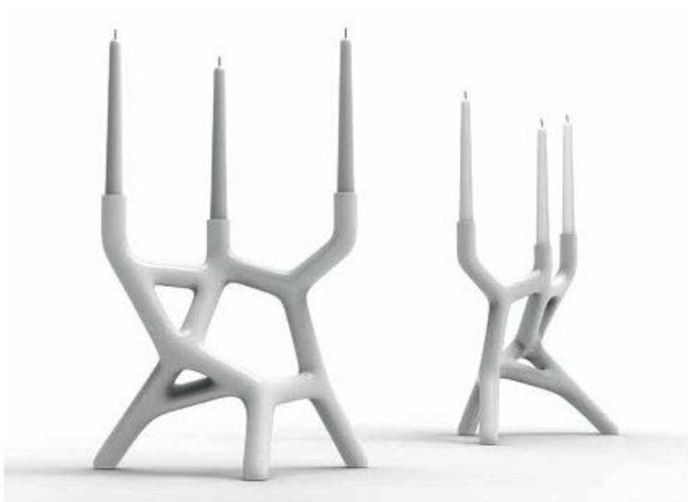
Designer: Cedric Ragot Title: CORAL CANDELIERE Color: Bianco Lucido Size: 34 x 21 x 36 cm (HxPxL) Edition: 255 $490 SPECIAL OFFER: $400