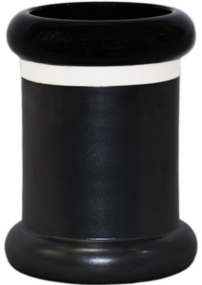
Designer: Ettore Sottsass Title: VASO Color: Ossidante Size: 28x19 cm (HxL) Edition: 171 $490 SPECIAL OFFER: $400