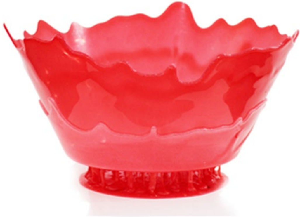
Designer: Gaetano Pesce Title: BIG SURPRISE 2 Color: Red Dimensions: 47 x 22 cm (LxH) Size: Large $1,300 SPECIAL OFFER: $1040