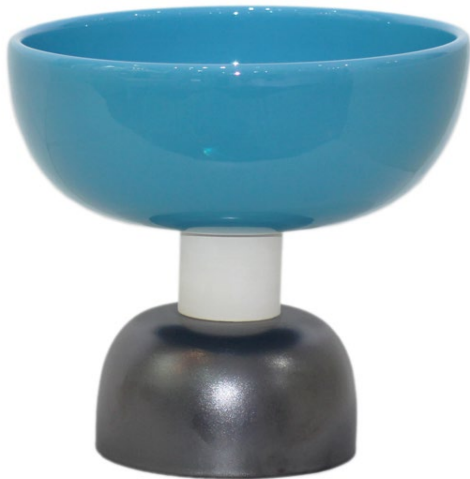
Designer: Ettore Sottsass Title: ALZATA GRANDE Color: Turchese Lucido Size: 24x24 cm (HxL) Edition: 167 $490 SPECIAL OFFER: $400