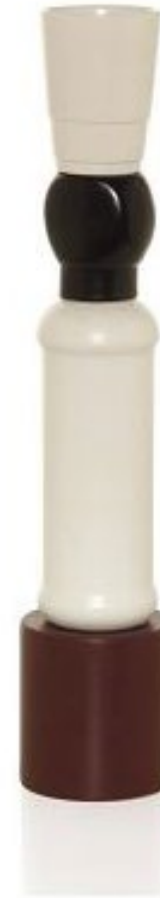
Designer: Nathalie du Pasquier Title: VASE Color: Size: 45 cm (H) Edition: 176 $655 SPECIAL OFFER: $530