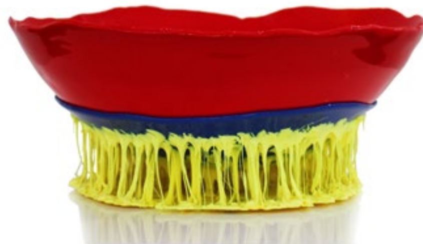
Designer: Gaetano Pesce Title: HALF BALL Color: Yellow, Red & Blue Dimensions: 38 x 19 cm (LxH) Size: Large $790 SPECIAL OFFER: $632