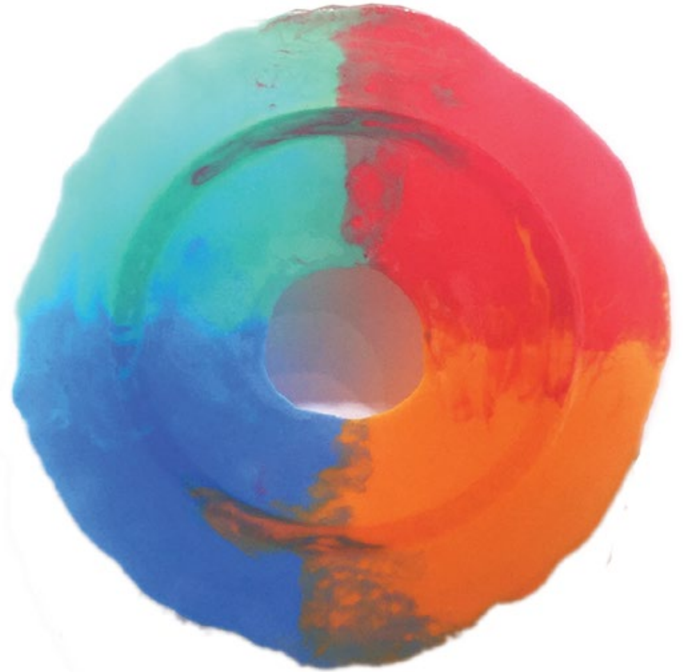
Designer: Gaetano Pesce Title: CLOUD LAMP Color: Red, Blue, Green, & Orange Dimensions: 88 x 88 x 12 cm (LxPxH) $3000 SPECIAL OFFER: $2,400