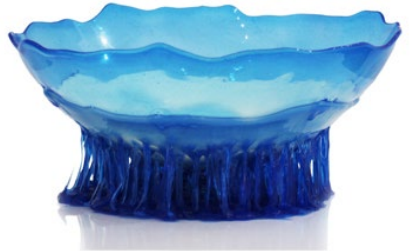
Designer: Gaetano Pesce Title: HALF BALL Color: Blue & White Dimensions: 38 x 19 cm (LxH) Size: Large $790 SPECIAL OFFER: $632