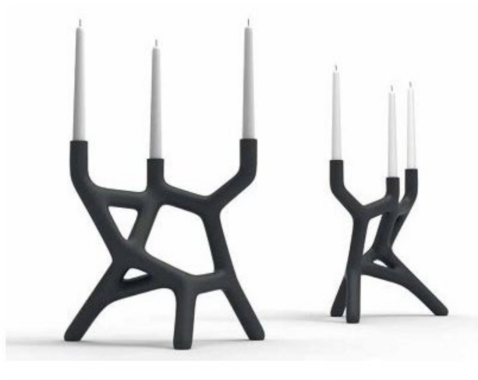
Designer: Cedric Ragot Title: CORAL CANDELIERE Color: Nero Matt Size: 34 x 21 x 36 cm (HxPxL) Edition: 256 $490 SPECIAL OFFER: $400