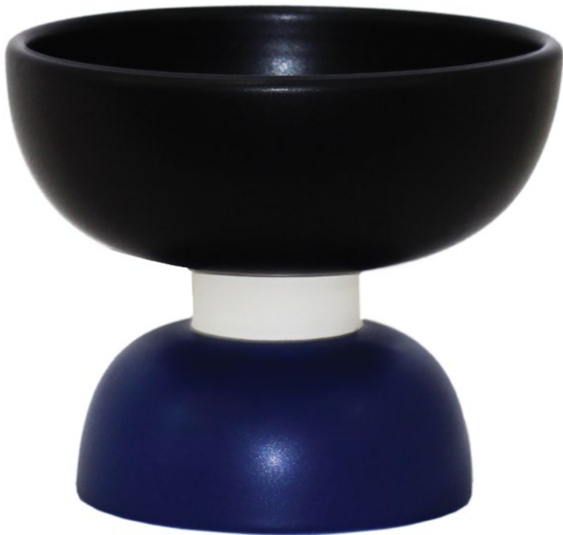
Designer: Ettore Sottsass Title: ALZATA PICCOLA Color: Nero matt-blu Size: 19x21 cm (HxL) Edition: 168 $355 SPECIAL OFFER: $300