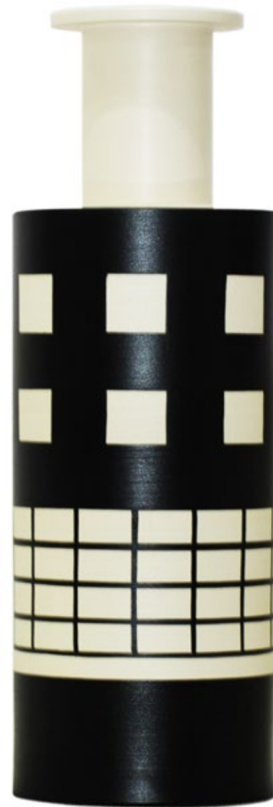
Designer: Ettore Sottsass Title: VASO ROCCHETTO Color: Bianco / Nero Size: 45 cm (H) Edition: 163 $845 SPECIAL OFFER: $680