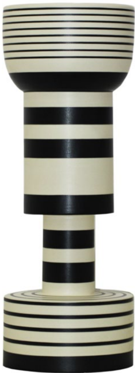
Designer: Ettore Sottsass Title: VASO CALICE Color: Bianco / Nero Size: 47 cm (H) Edition: 162 $1,035 SPECIAL OFFER: $830