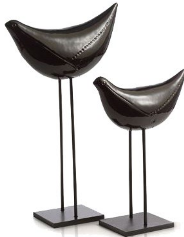
Category: Arkitectura Title: COPPIA UCCELLI Color: Neri Size: 21 | 18 cm (H) Edition: 131 $435 SPECIAL OFFER: $350