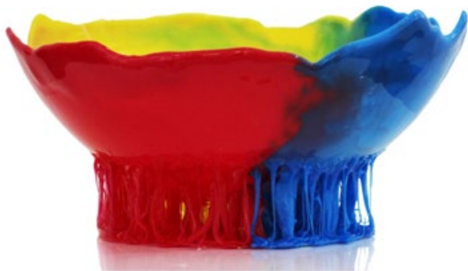
Designer: Gaetano Pesce Title: HALF BALL Color: Multicolor Dimensions: 38 x 19 cm (LxH) Size: Large $790 SPECIAL OFFER: $632