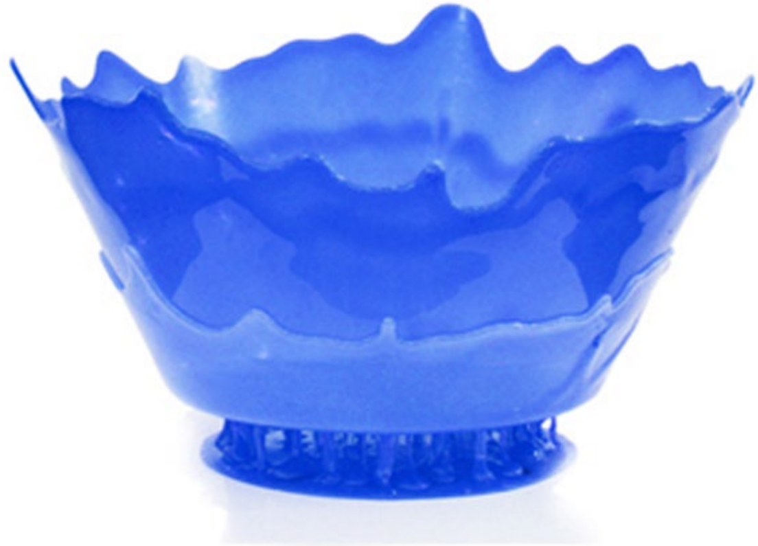
Designer: Gaetano Pesce Title: BIG SURPRISE 2 Color: Blue Dimensions: 47 x 22 cm (LxH) Size: Large $1,300 SPECIAL OFFER: $1040