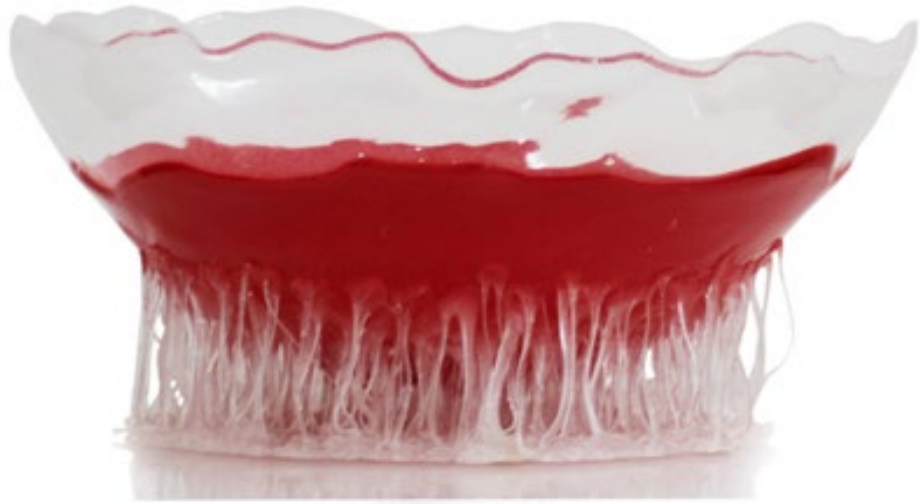
Designer: Gaetano Pesce Title: HALF BALL Color: Red & Clear Dimensions: 38 x 19 cm (LxH) Size: Large $790 SPECIAL OFFER: $632