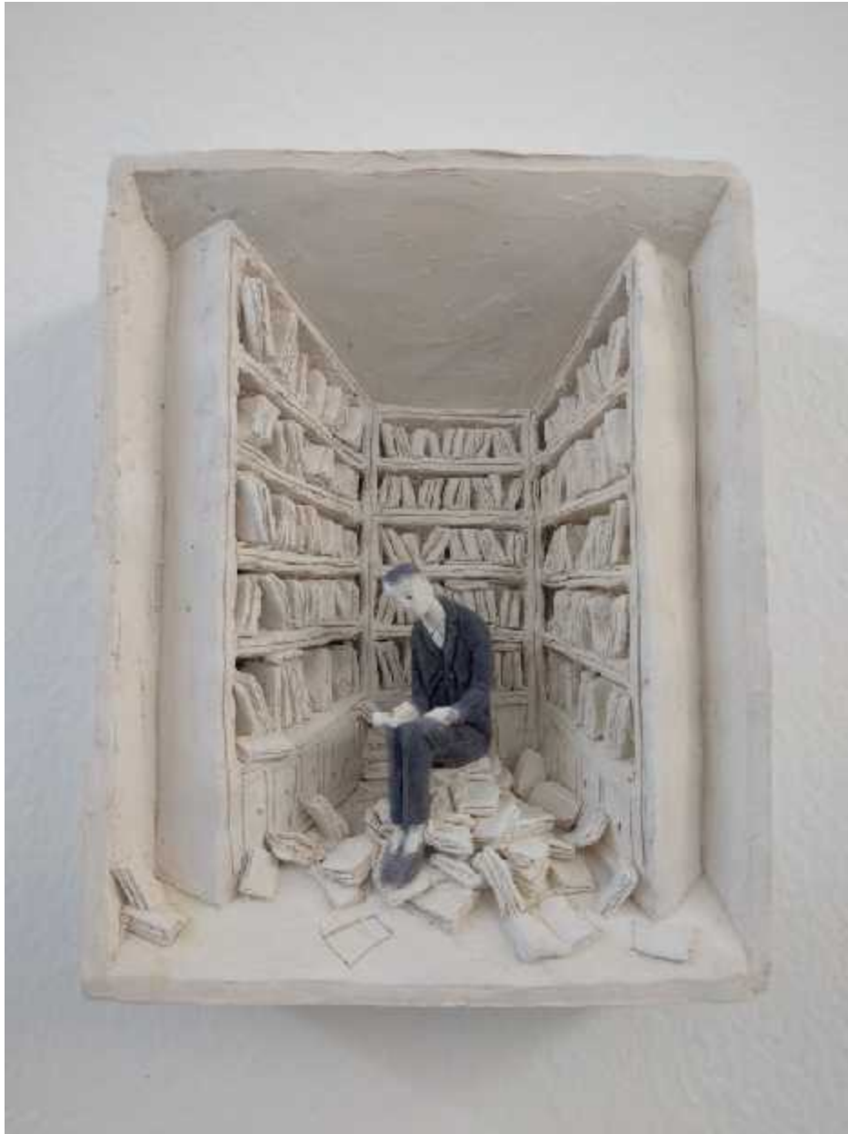
Artist: Pino Deodato Title: Little thoughts Medium: Ingobbio Terracotta Dimensions: 15 x 20 x 05 cm Year: 2017 $4,300 SPECIAL OFFER: $3,440