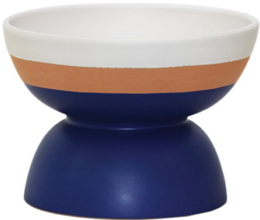
Designer: Ettore Sottsass Title: CENTROTAVOLA GRANDE Color: Bianco Size: 22x29 cm (HxL) Edition: 169 $625 SPECIAL OFFER: $500