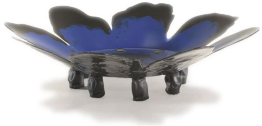
Designer: Gaetano Pesce Title: PAPAVERO VASE Color: Blue Dimensions: 71 x 27 cm (LxH) Size: Large $1500 SPECIAL OFFER: $1200