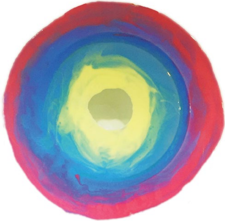
Designer: Gaetano Pesce Title: CLOUD LAMP Color: Red, Blue & Yellow Dimensions: 88 x 88 x 12 cm (LxPxH) $3,000 SPECIAL OFFER: $2400