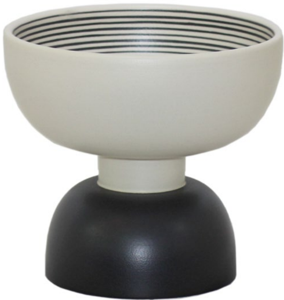
Designer: Ettore Sottsass Title: ALZATA PICCOLA Color: Bianco / Nero Size: 18x21 cm (HxL) Edition: 160 $370 SPECIAL OFFER: $300