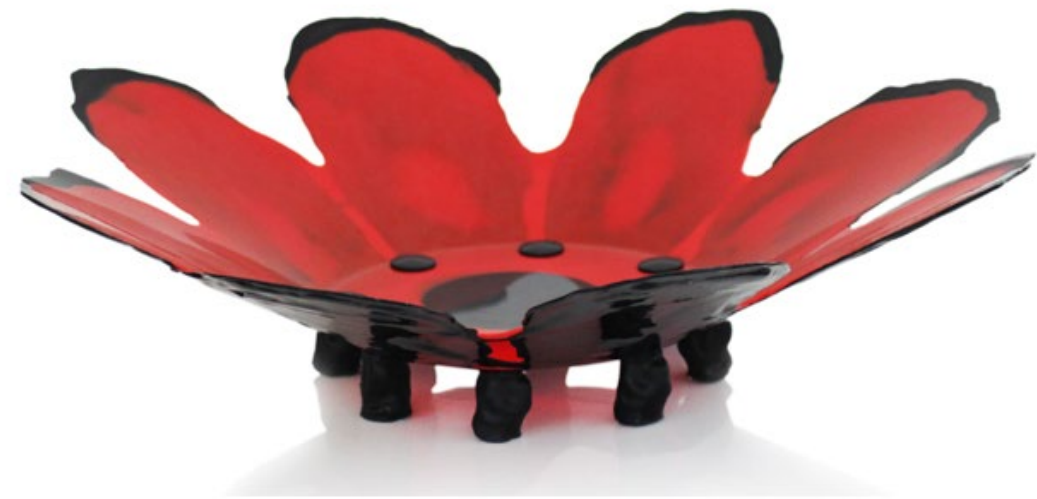
Designer: Gaetano Pesce Title: PAPAVERO VASE Color: Red Dimensions: 71 x 27 cm (LxH) Size: Large $1500 SPECIAL OFFER: $1200